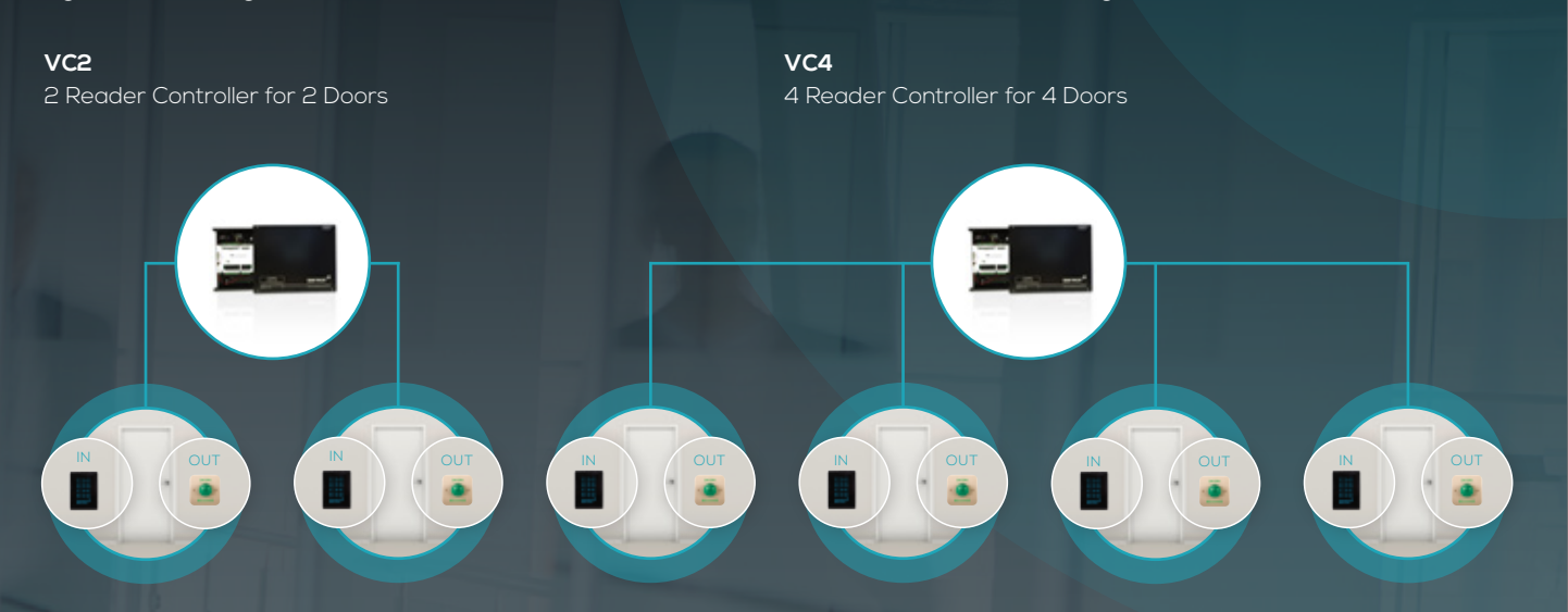
Figure 1 : The diagram below shows the controllers in a read in and exit button out configuration.